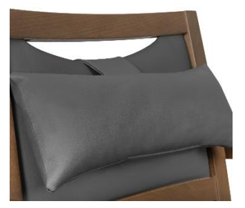
Height Adjustable backrest cushion available in Taupe, Truffle and Ash