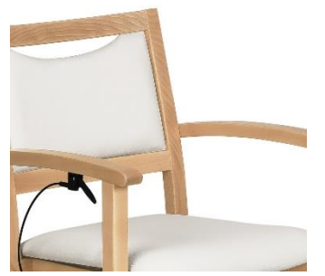
2LiftU PLUS lever mechanism allowing raising action to be user controlled available for 48cm wide