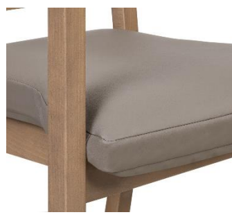
3cm high Anti decubitus cushion available in Taupe and Truffle