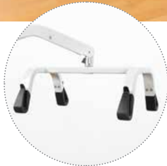
4 point spreader bar