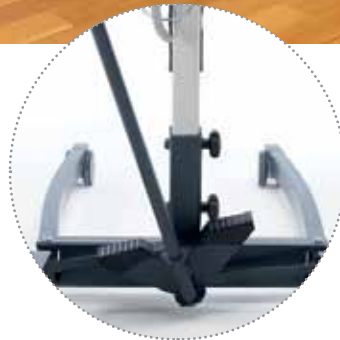
Lever for mechanical leg spread