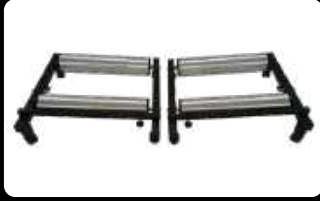
TRAINER UNIT X 2

You should find the following items in your newly opened Invictus Active Trainer box: (Note these items may be supplied pre-assembled)