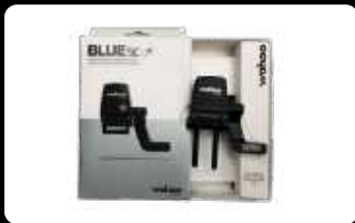
WAHOO SPEED SENSOR X 1

Record your speed, distance and heart rate – available to upgrade at any time!