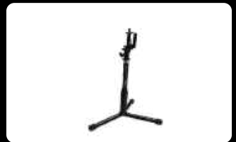
PHONE STAND & HOLDER X 1