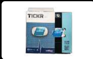
WAHOO HEART RATE SENSOR X 1