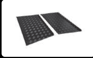
RAMP X 2