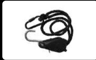
RETAINING STRAP X 1