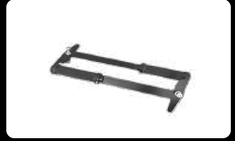
BRAKE X 2