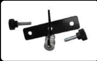
SPACER LOCK & WASHERS X 2