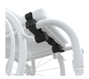
Horizontal Install LapStacker Flex attaches horizontally around single frame folding wheelchairs.