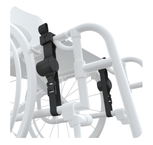
Vertical Install LapStacker Flex attaches vertically between the top and bottom parallel