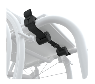
Horizontal Install LapStacker Flex attaches horizontally around rigid frame wheelchairs.