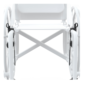
Clearance Check clearance between top and bottom tubes.