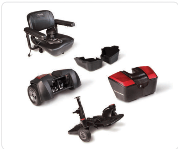
One-hand "Feather Touch" disassembly

The all-new Go Chair® is re-engineered from the ground up, offering a bold style available in an array of contemporary colours. Enhanced performance and comfort, along with feather-touch disassembly, allows you to enjoy lightweight travel and independence on the go. With an increased weight capacity of 136 kgs (300 lbs.) and a sleek, bold look, the Go Chair® makes travel easy.